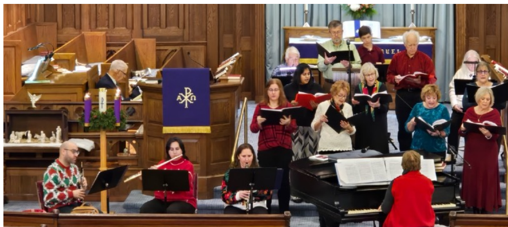
Above: Multigenerational Boomwackers