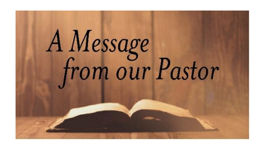
Rev. Meredith Jeffers

Spring has sprung at the First Congregational Church of Wallingford! Outside trees are budding, flowers are blooming, warmth is returning, and fresh fragrant breezes are blowing. Everywhere we look there are signs of new life. With spring comes promise. With spring comes hope.